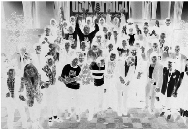
Photograph during the recording of “We Are the World.” This figure demonstrates how polarity inversion effects face recognition in humans. Several famous artists are in the picture including Ray Charles, Lionel Ritchie, Stevie Wonder, Michael Jackson, Tina Turner, Bruce Springstein, and Billy Joel though they are very difficult to identify.