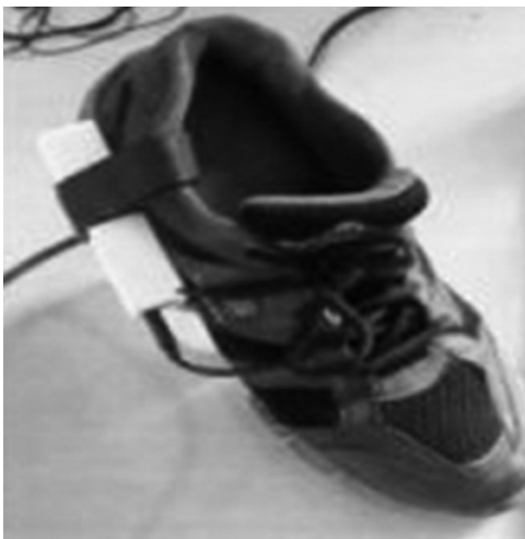
Figure 6. Complete Built-in Arrangement.

as a free energy and a potential sustainable energy for future. For making the 'Walk N Charge Boot' the arrangement uses three sets connected in series of two parallel connected Barium Titanate piezoelectric transducers. Figure 4 shows sample of transducer used in experiment. Since these transducers produce Alternating Current, it needed to be converted to dc by using a bridge rectifier as shown in Figure 5 and gives 5V-15V as output. The output of bridge rectifier is connected to the charging wire of the power bank of 200mAH as shown in Figure 6.