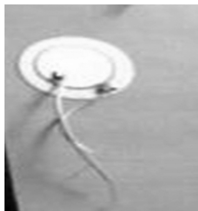
Figure 4. Single-Piezo Transducer.