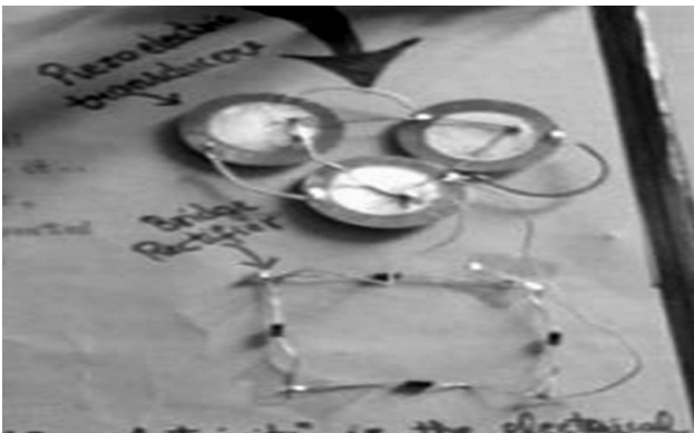
Figure 5. Demonstration Setup.

Initiation was started up by reading the concept of Piezo electricity. Then, after searching for the component (Piezo Transducer) required making the phenomena work, the working and connections were learned practically by using soldering, connecting wires and multimeter etc. Then, Searching internet and thinking led us to its various applications that could act