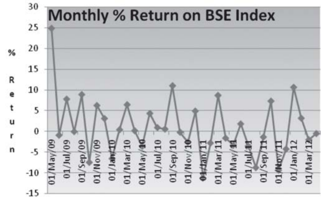
Figure 1. % Return on BSE Index.

The regression results and the chart showing return vs size factor and value are depicted below.